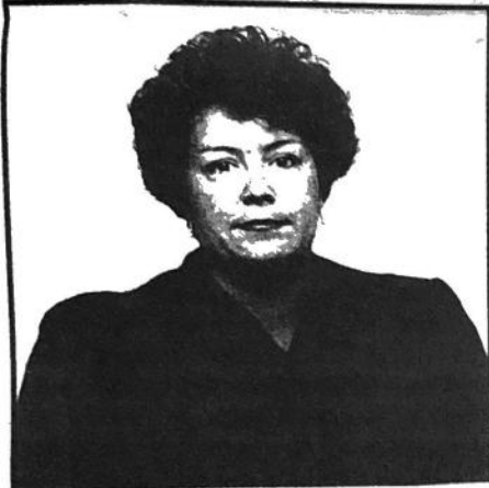
The Honorable Jill E. Shibles

Until recently, the Canadian Government has dealt with cases alleging abuse at residential schools on a case by case basis. The government has reportedly paid out more than $3-million in out of court settlements in individual cases involving former students of a school in Saskatchewan. As of last year, 72 out of about 240 claims have been settled in Saskatchewan and British Columbia. ■